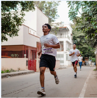
Annual 5K Run